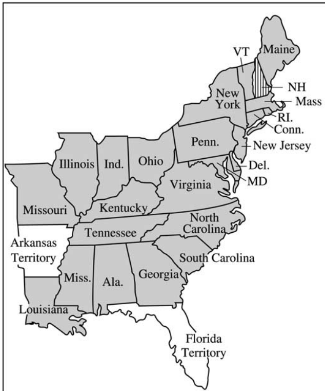
PRESIDENTIAL ELECTION, 1820